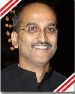
Rohan Sippy Director (RSACE) Writer, Director & producer.

Cinema today has evolved with mind boggling technological developments happening each day and it is more and more imperative to study the science of film making in a structured manner and also inculcate a habit of continuing to learn all through your life. RSACE will help students imbibe the discipline of learning that will impact their growth all through their lives.