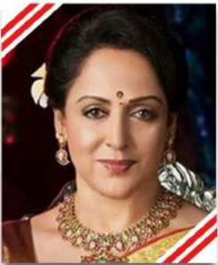
Hema Malini Director (RSACE) Actor, director, producer, Dancer & politician

In the year 2016 CBFC certified nearly 25000 feature films, videos, ad films, short films etc. This shows there is a humongous work force continually required to operate in the ever growing moving images landscape. The television industry itself is about Rs.60,000 crore, not to mention the other media platforms where a huge amount of investment is also happening. To create skilled professionals who can operate in these mediums without too much hand-holding is the need of the hour and it is exciting that RSACE has come at the right time and the right place.