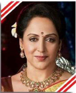
Hema Malini Director (RSACE) Actor, director, producer, Dancer & politician

In the year 2016 CBFC certified nearly 25000 feature films, videos, ad films, short films etc. This shows there is a humongous work force continually required to operate in the ever growing moving images landscape. The television industry itself is about Rs.60,000 crore, not to mention the other media platforms where a huge amount of investment is also happening. To create skilled professionals who can operate in these mediums without too much hand-holding is the need of the hour and it is exciting that RSACE has come at the right time and the right place.