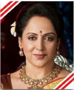
Hema Malini Director (RSACE) Actor, director, producer, Dancer & politician

In the year 2016 CBFC certified nearly 25000 feature films, videos, ad films, short films etc. This shows there is a humongous work force continually required to operate in the ever growing moving images landscape. The television industry itself is about Rs.60,000 crore, not to mention the other media platforms where a huge amount of investment is also happening. To create skilled professionals who can operate in these mediums without too much hand-holding is the need of the hour and it is exciting that RSACE has come at the right time and the right place.