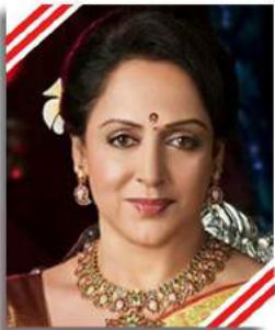
Hema Malini Director (RSACE) Actor, director, producer, Dancer & politician

In the year 2016 CBFC certified nearly 25000 feature films, videos, ad films, short films etc. This shows there is a humongous work force continually required to operate in the ever growing moving images landscape. The television industry itself is about Rs.60,000 crore, not to mention the other media platforms where a huge amount of investment is also happening. To create skilled professionals who can operate in these mediums without too much hand-holding is the need of the hour and it is exciting that RSACE has come at the right time and the right place.