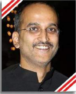
Rohan Sippy Director (RSACE) Writer, Director & producer.

Cinema today has evolved with mind boggling technological developments happening each day and it is more and more imperative to study the science of film making in a structured manner and also inculcate a habit of continuing to learn all through your life. RSACE will help students imbibe the discipline of learning that will impact their growth all through their lives.