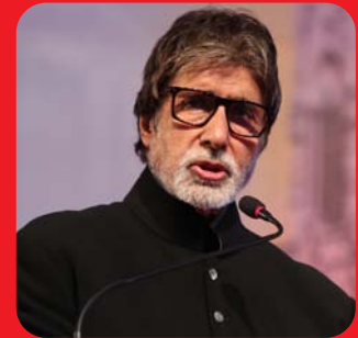
Amitabh Bachchan Padma Vibhushan Actor-Producer

"At RSACE, it is our endeavour to equip students with the skills required to create content that keeps pace with new-age media. Having said that, while the mediums have changed, the ethos of cinema and entertainment remains untouched and at its very core, cinema is all about stories. RSACE's core purpose is to produce generations of film professionals that will contribute to great storytelling."