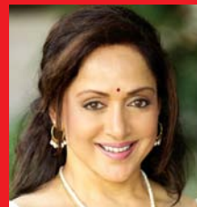
Director Hema Malini