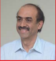
Daggubati Suresh Babu