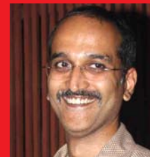
Director Rohan Sippy